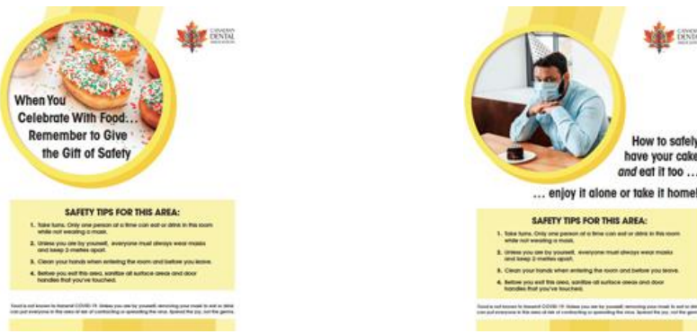
A preview of two posters in the celebration edition of the Be Vigilant Inside and Outside the Op! series. Colours and text may vary as PDAs may adapt the materials for use by their member dentists.

All materials will be available in English and French, and can be used not only around the holidays, but also for other special events (i.e. staff birthdays, etc.). The final materials will be distributed to Corporate Members via CDA's Dental Communications Group. Corporate Members can co-brand and adapt the content, as deemed appropriate.